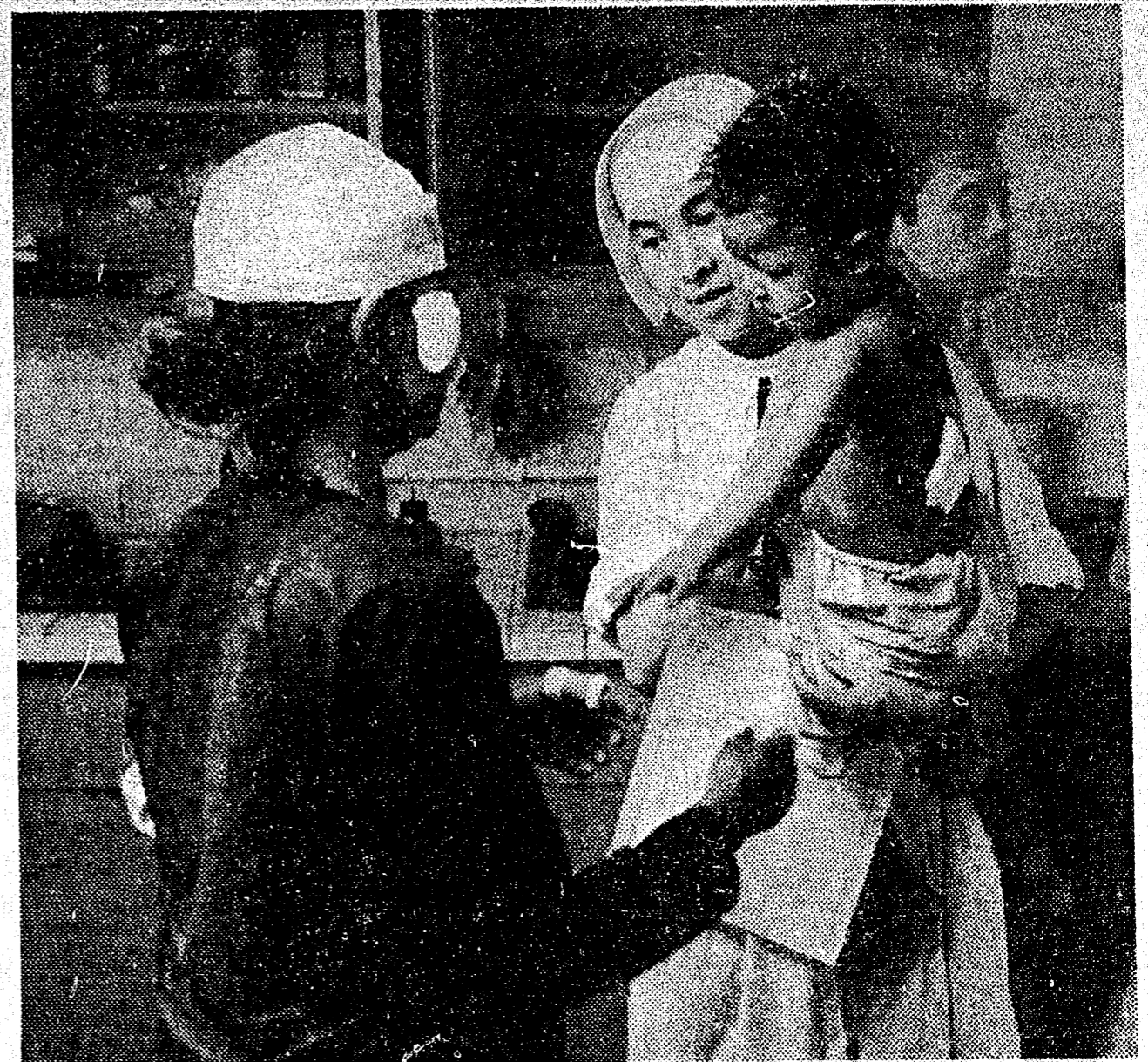
become nurse assistants, like those who already provide much of the civilian medical care in Vietnam. In another room (right photo) a young victim of a Viet Cong