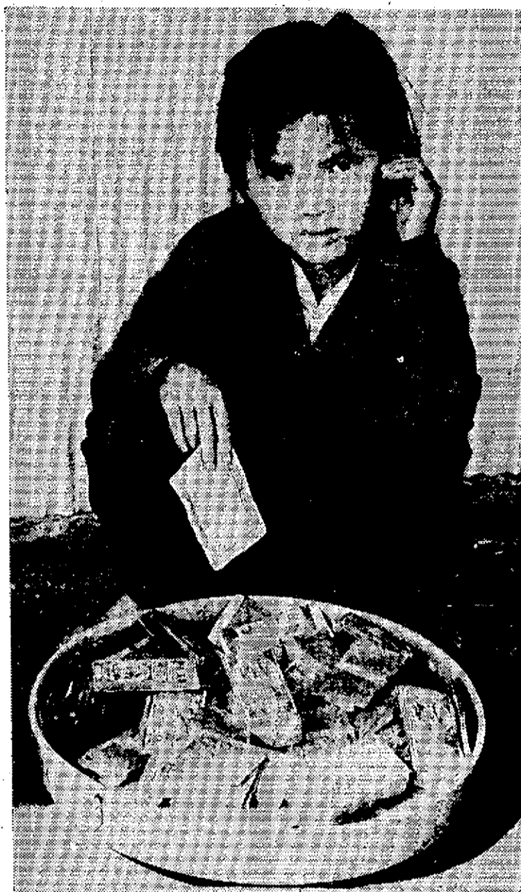
Greetings for Sale

A little more than an hour later, the spokesman said, the Viet Cong fired six rounds into Moc Hoa, capital of Kien Tuong Province close to the Cambodian border and due west of Saigon.