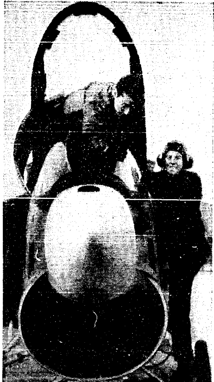
Naval Reserve mechanics at Andrews AFB near Washington, D.C., service an F4 Crusader in preparation for arrival of reserve airmen called to active duty.

NEW YORK (UPI)—A sharp plunge followed by recovery bit the New York Stock Exchange Thursday the White House announcement of a Reserve callup. Volume reached a record 12,410,000 shares for the four-hour session. Details on Page 8.